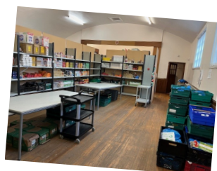
Today's efficient operation at Viewforth Church hall