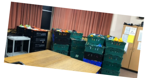
Where we started: Dysart St Clair Parish Church